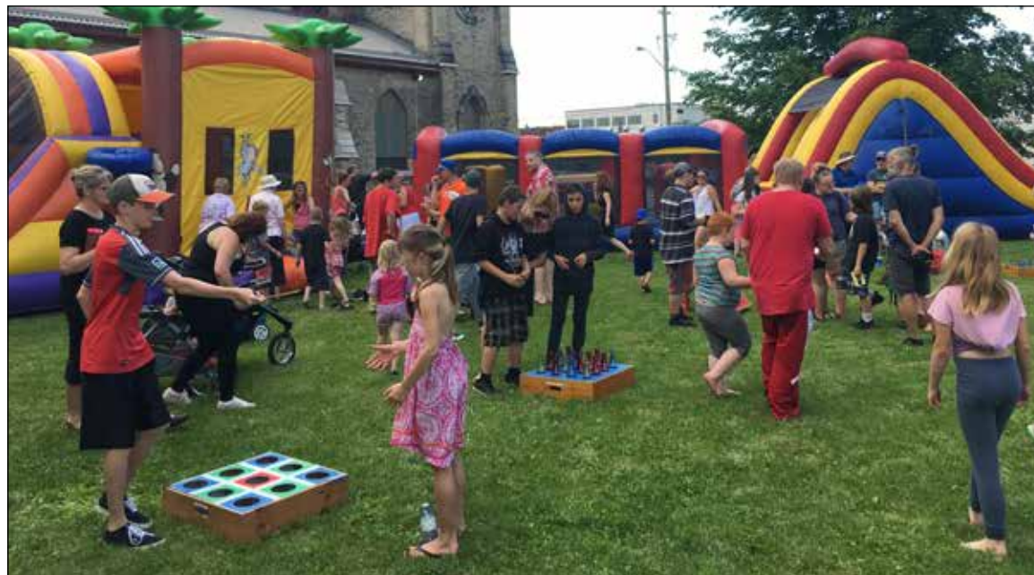
Students, parents and volunteers enjoy the festivities outside St. Paul, Lindsay. At right, volunteers get ready to provide lunch.

The event featured a barbecue, a bouncy castle, games and "summer survival kits" for the kids that included sunscreen and toothpaste. Volunteers from the churches helped out, bringing the total number of people to about 140. St. Paul's received a $500 grant from the Trent-Durham Area Council to