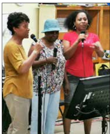
Parishioners sing during karaoke night.

The congregation grew quickly, and soon it had to move to the larger science room, then to the stage area and, finally, to the gymnasium. This growth in numbers continued, bringing the congregation closer each year to realizing its dream of building a permanent home. A name for the new church was discussed and "St. Michael the Archangel" was agreed upon, after Coventry Cathedral, a church with a history based on hope, reconciliation and community.