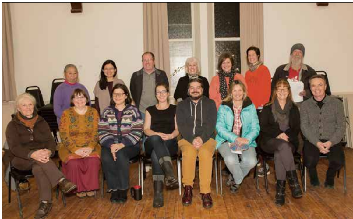
Repair Café volunteers gather for a photo in the church hall. At right, signs made by children to point visitors to repair stations.

The Repair Café concept arose in the Netherlands in 2009. The Repair Café Foundation provides support to local groups around