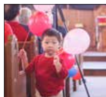
A young boy enjoys playing with balloons in the aisle.

The church has been celebrating Chinese New Year since 2016 and some people have joined the church as a result, she says. The church's Mandarin Ministry worships on Sundays at 1 p.m.