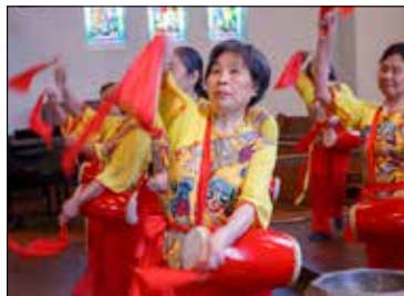
Drumming by members of the Paradise Seniors Association in Markham.