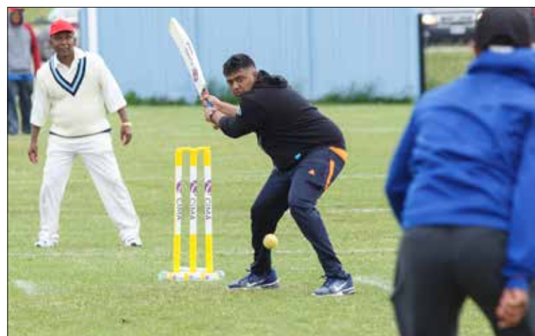
A batter readies for the ball at last year’s Anglican Church Cricket Festival.