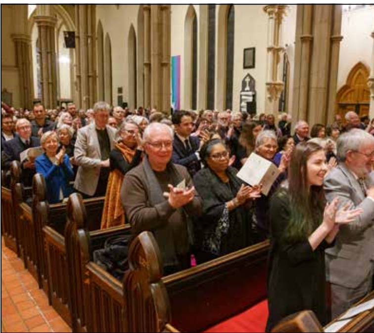
The large congregation applauds the new canons.