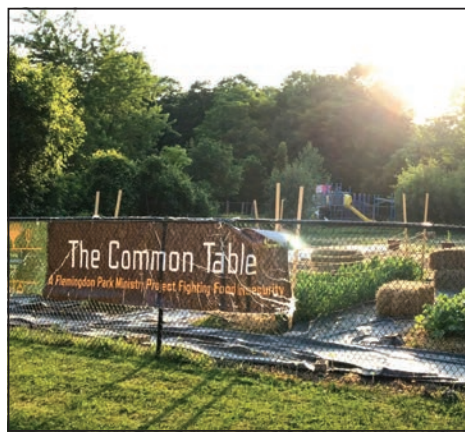
The Common Table, an outreach project of Flemingdon Park Ministry, grows produce at Our Saviour, Don Mills for the surrounding community. At right, a pollinator garden at St. Martin in-the-Fields, Toronto.

tree or two? Or maybe your church only has space for a small bed of native plants or some pollinator annuals in a planter.