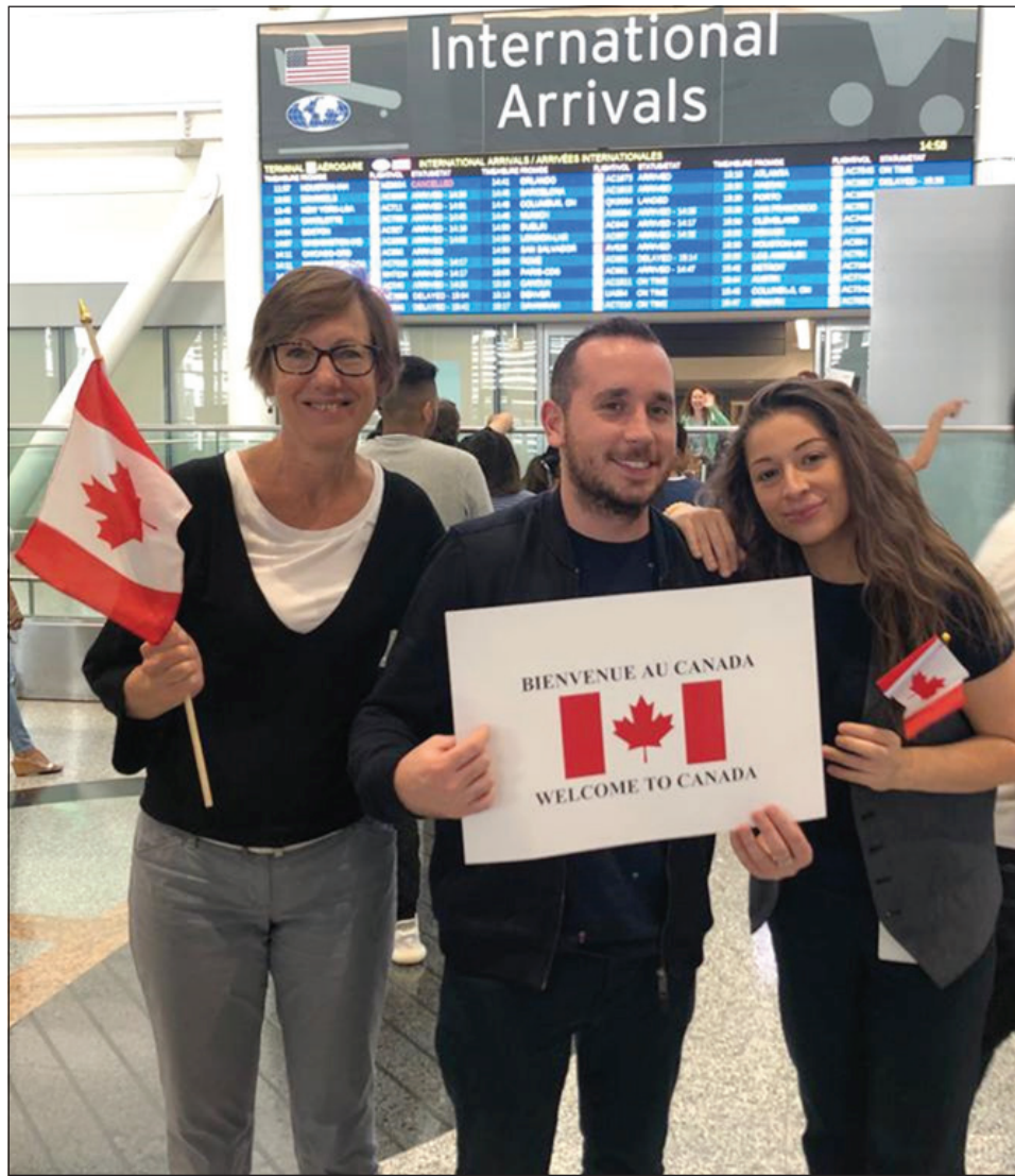
Volunteers with the St. James Cathedral and Community Refugee Committee wait for a woman and her young son at Toronto Pearson International Airport in Mississauga in 2019.

Usually we behave better than that – or sometimes we do. The modern tradition of refugee assistance really began in the late 1970s with people crammed into rickety boats across the stormy seas fleeing Southeast Asia. Anglican churches raised money and formed committees to help Boat People settle into their new home, providing practical and emotional support. An even bigger effort helped Somalis arriving with much bigger families. St. Clement, Eglinton sponsored two related Somali families – 18 people – headed