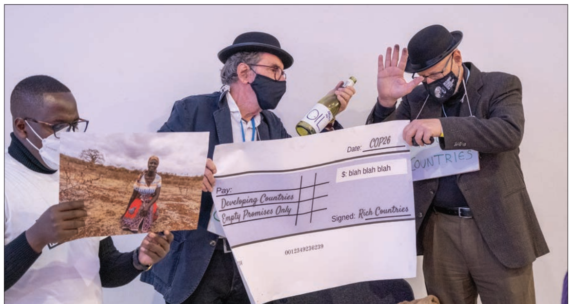
Clockwise from top right: Christian activists participate in a climate march as part of COP26; ACT Alliance activists demand that wealthy countries contribute financing for loss and damage in the developing world due to climate change while actors portraying wealthy countries swig oil, stuff their ears with coal, and hold up a cheque full of “empty promises;” a sign at the climate march reads “No more hot air;” Ugandan Christians at the climate march.

uncertain measures, such as untested carbon capture technology, or reforestation efforts that could be wiped out in a day by wildfire.