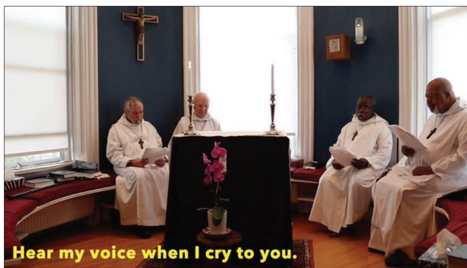
Brothers of the Order of the Holy Cross lead Synod in a pre-recorded Evening Prayer.

The following lay members were elected to serve on Synod Council: