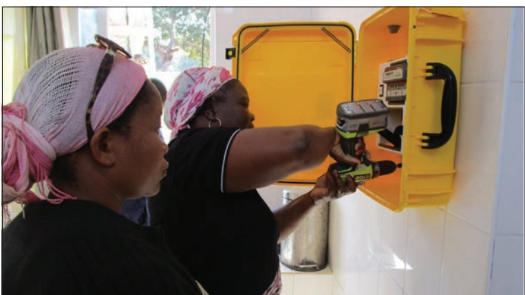
Two trainees install a solar suitcase at a health clinic in rural Mozambique.