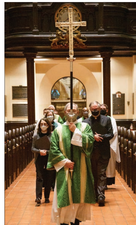
The Processional at the 160th Regular Session of Synod Opening Eucharist.