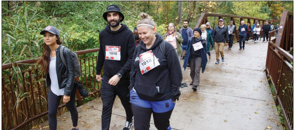
People take part in St. James Cathedral and Community Refugee Committee’s walkathon in response to the humanitarian crisis in Afghanistan.