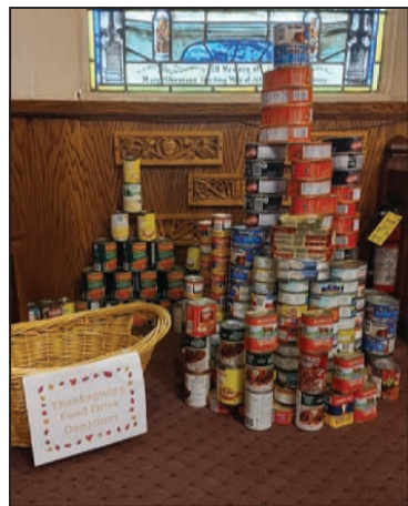
The ‘Tower of Tins’ in St. Paul, Lindsay, ready to be given to those in need.