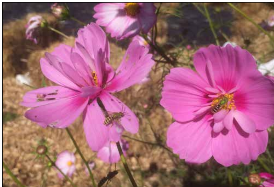
Ground-dwelling bees herald the arrival of spring at the Community Table farm.