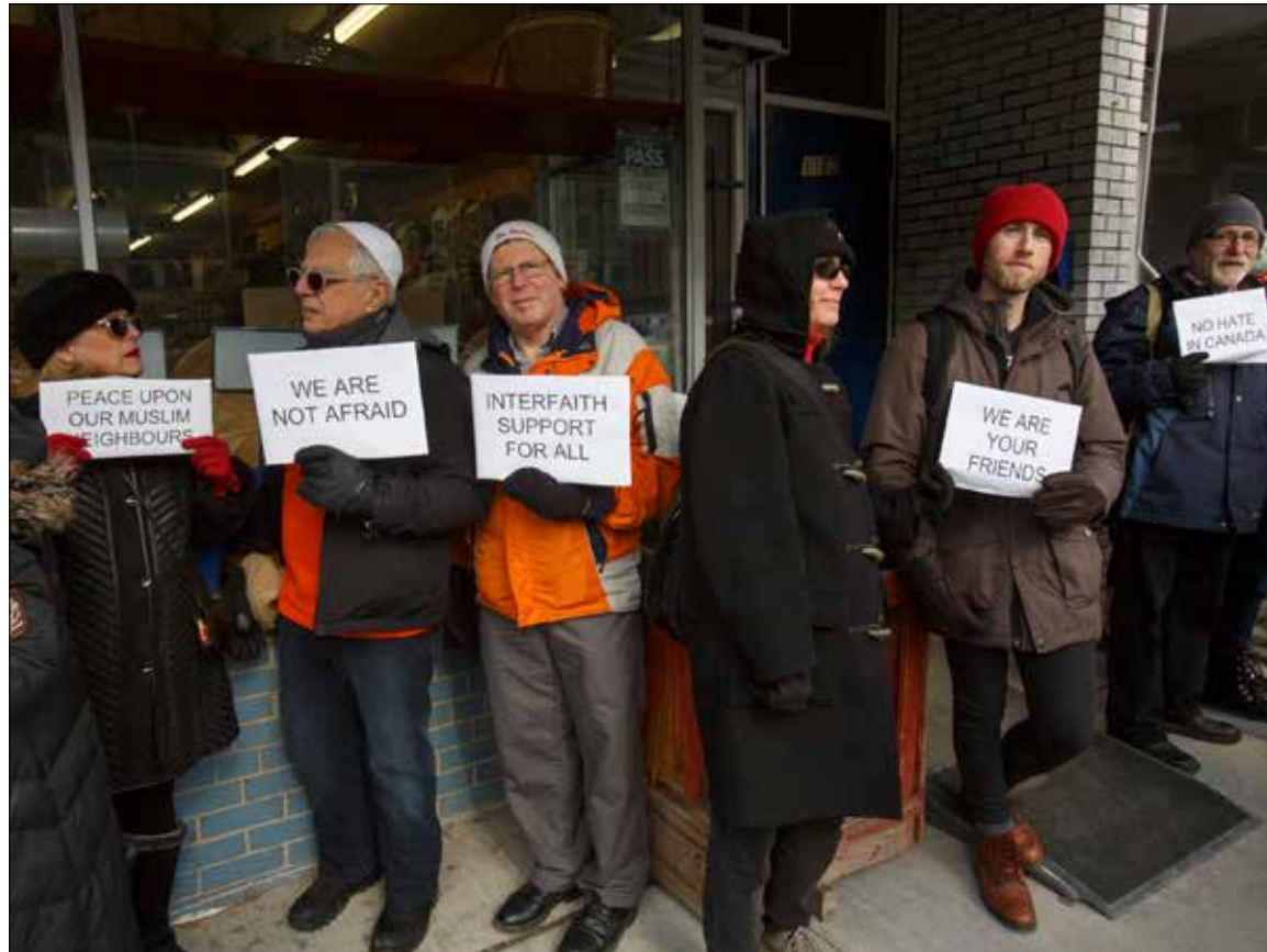
People from different faiths take part in a Ring of Peace outside a Toronto mosque in 2017.