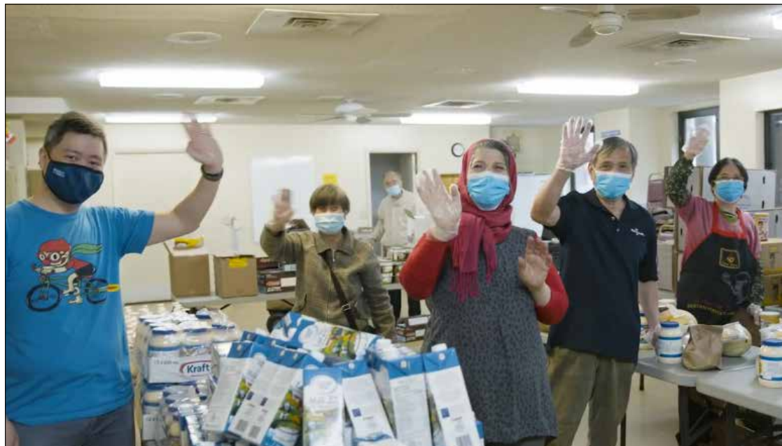
Volunteers help prepare meals at Flemingdon Park Ministry, which is financially supported by FaithWorks.