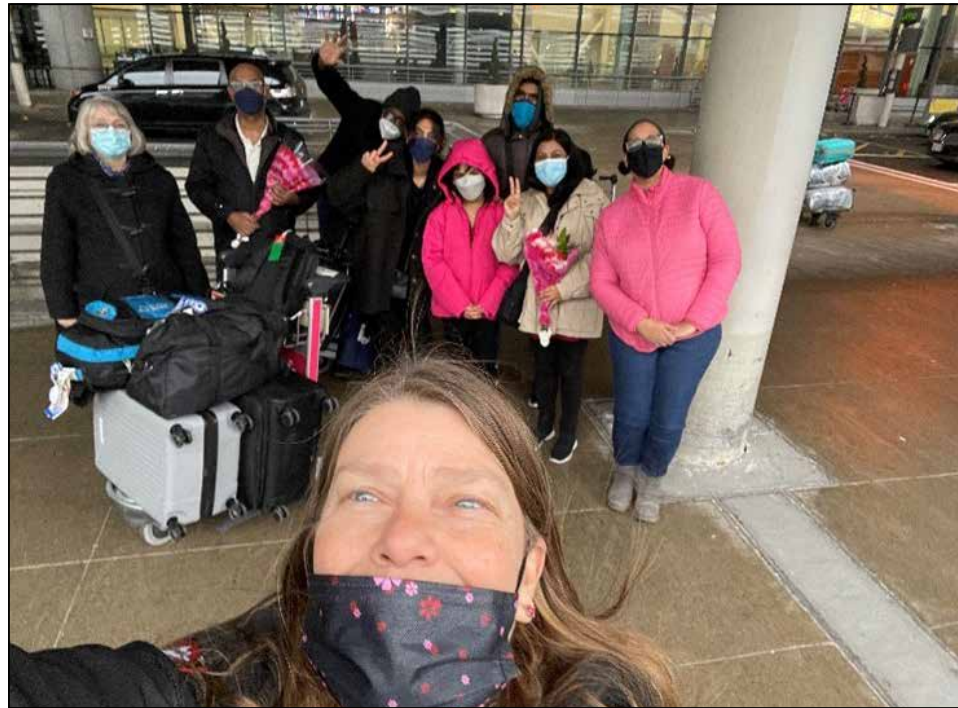
A volunteer takes a selfie with a refugee family at Toronto Pearson International Airport in Mississauga in February. The Diocese of Toronto is celebrating Refugee Sunday on May 15 and resources for parishes and individuals are available.

Through the Anglican-United Refugee Alliance (AURA), a Pakistani family (we are not revealing their full identity for their safety's sake) was sponsored by a coalition of churches in Toronto: St. Anne,