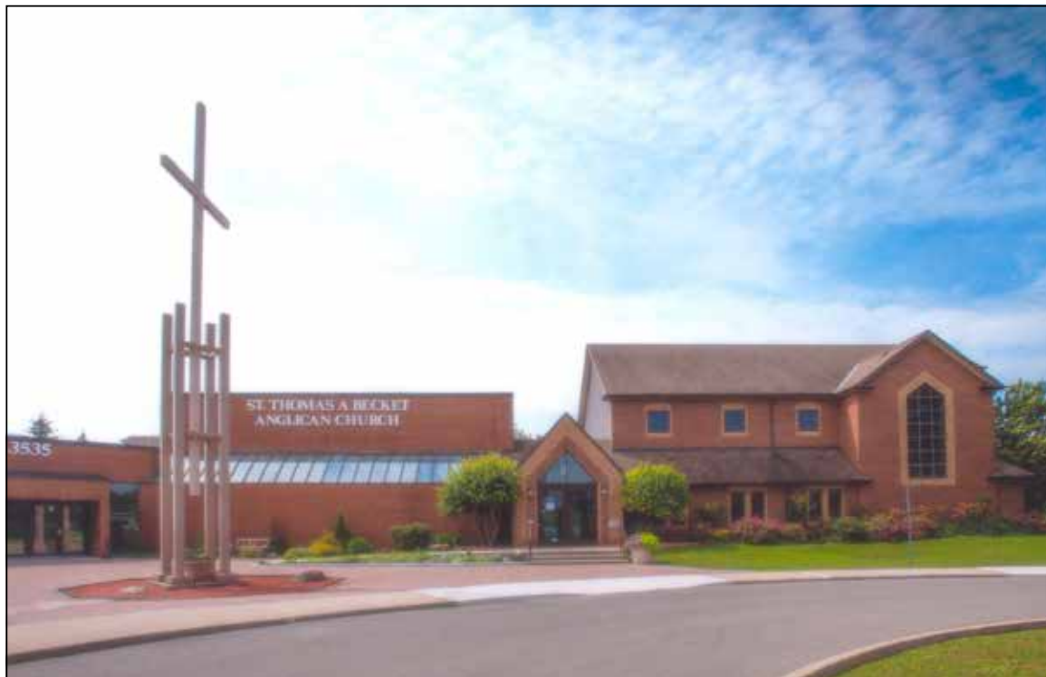
St. Thomas à Becket, Erin Mills South