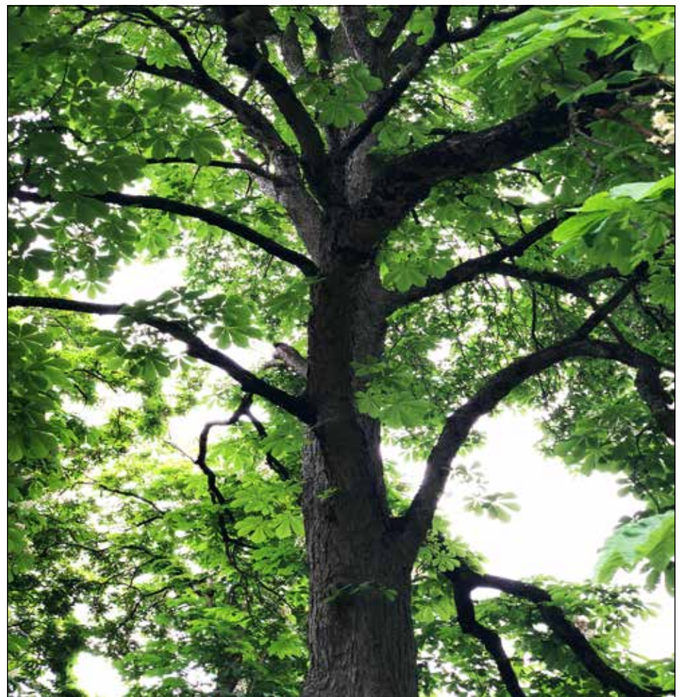
A mature tree nourishes the earth and its creatures.

It doesn’t take a long walk around your own neighbourhood to see the effects of human-caused climate change. As a