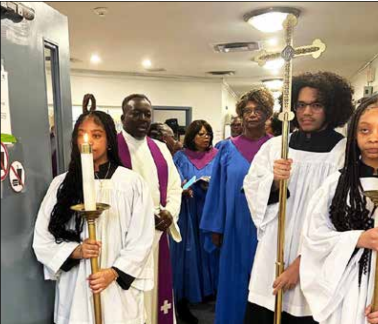
The procession prepares to enter.