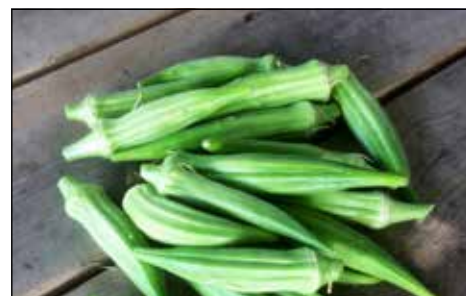
Okra, a vegetable for food and good health.

“In the past, when I thought of eggplant, I only envisioned the bell-shaped deep purple vegetable. But at the