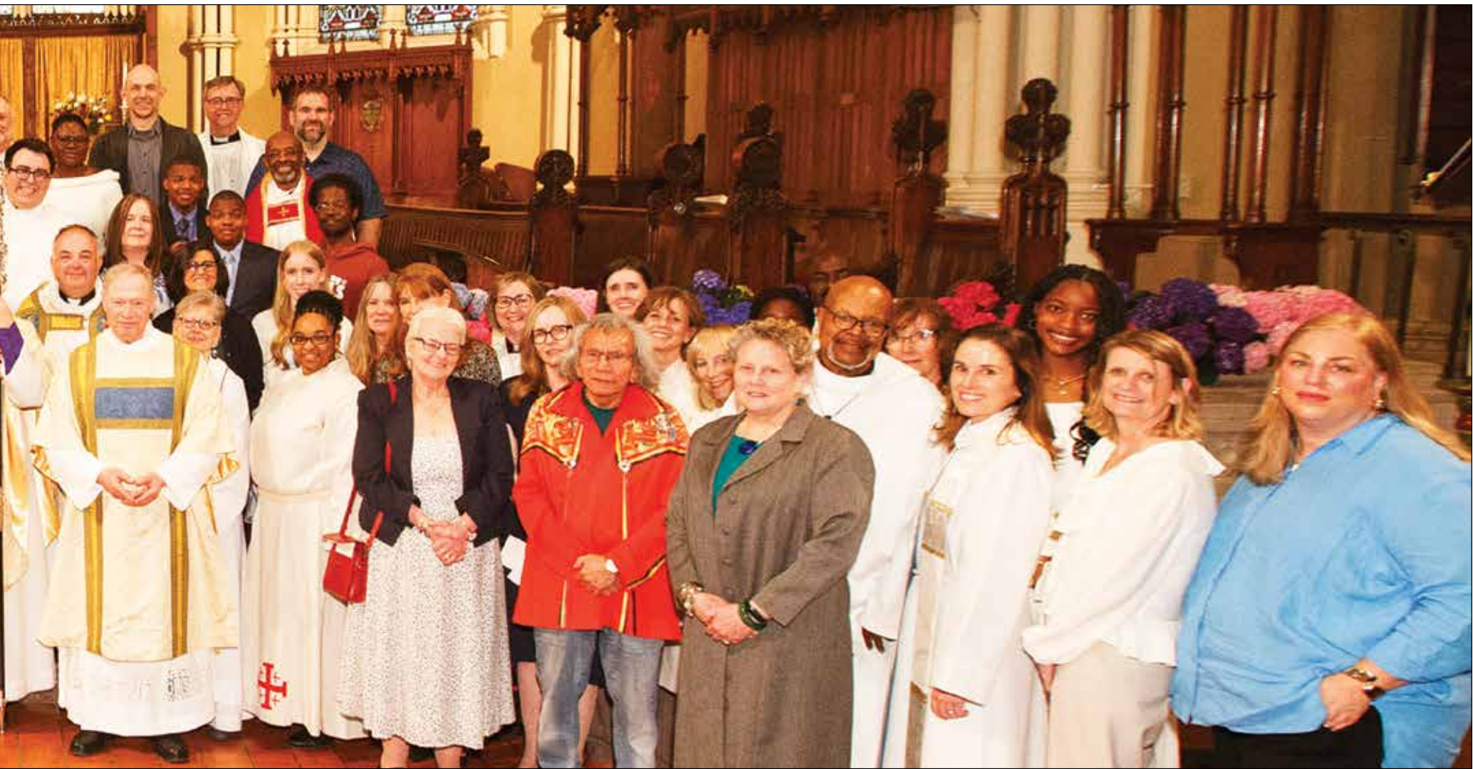
AL DAY into the Anglican Communion service at St. James Cathedral in April. The participants came from Christ Church, Deer Park, St. James Cathedral, Holy Family, Heart Lake, St. James the Apostle, Brampton, Holy Trinity, Thornhill, College School and Wycliffe College.