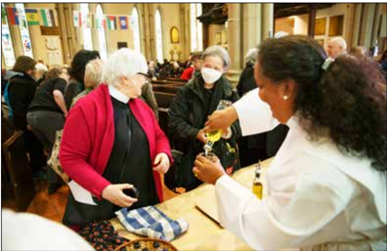
Clergy receive holy oil after the service for anointing.