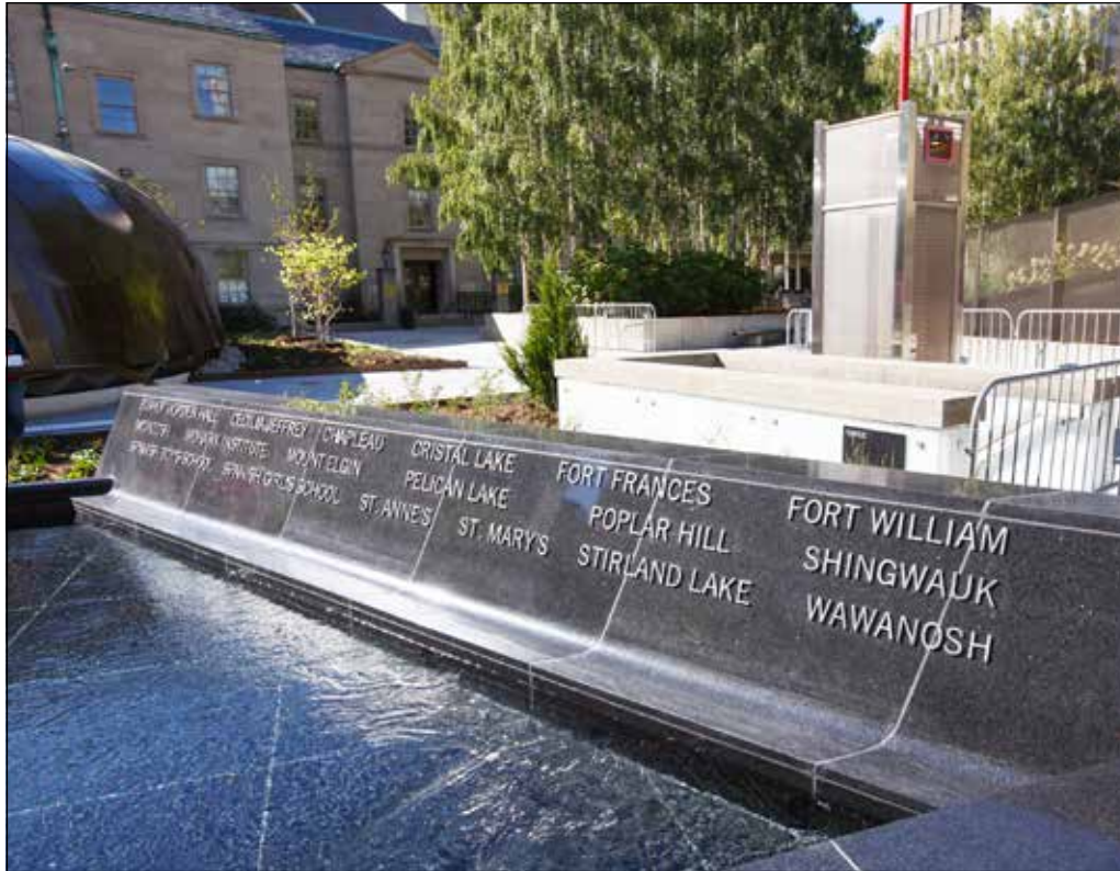
The names of the Residential Schools in Ontario are displayed at the Spirit Garden in Toronto.

Calls to Action #45 and #49 call for the repudiation of the Doctrine of Discovery and theologies that justify European sovereignty over Indigenous lands and peoples, and a renewal of the treaty relationship that is built on mutual respect. The Doctrine of Discovery gave religious and legal justification for the forced enslavement of non-Christian people and the theft of their lands. This dehumanizing doctrine is the bedrock of the Residential School system, where Indigenous children were subject to forced labour. Many survivors have likened their experience of exploitation to concentration camps. The treaty process contrasts this culture of violence against children and dehumanization, calling on all people on this land to live with respect and responsibility to all life. Call to