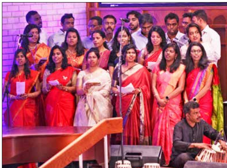
The Ezraites Choir and the Church of St. Bede Choir perform.