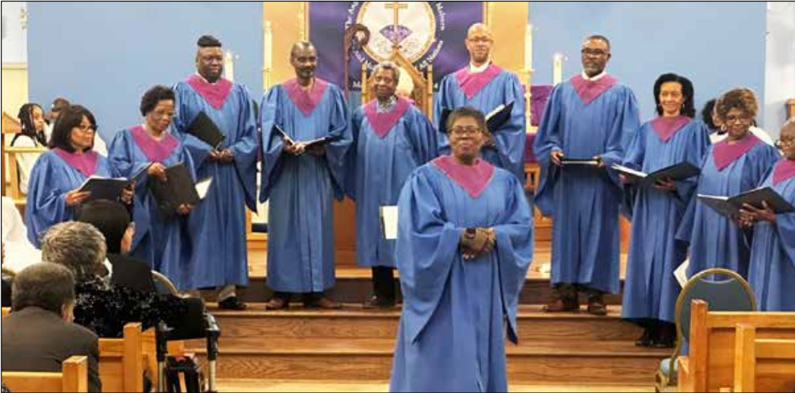
Nativity's church choir performs. The evening's music included steel pan and drumming.

Brian Chandler is a member of Church of the Nativity, Malvern.