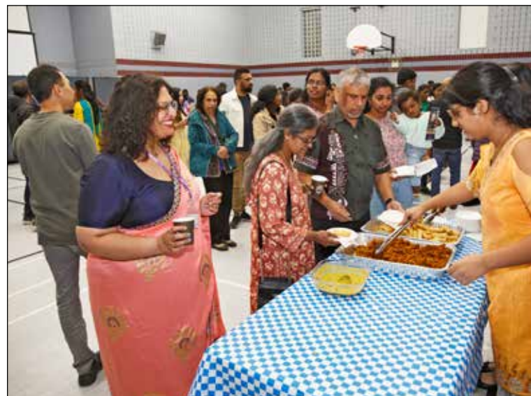
Enjoying fellowship and refreshments after the concert.