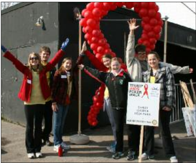
The Young Anglican Leaders of Christ Church, Deer Park, show their team spirit at the Trump AIDS Poker Walk in Toronto on April 28.