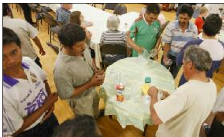
A weekly dinner at the church brings rest and refreshment.

We are trying to develop within Beaverton and the surrounding area a greater understanding of the two cultures and languages. People from outside the parish, including local business owners and post office workers, have enrolled in the Spanish lessons, and some have become involved in the ministry. In March, we also began a lunch-hour Spanish club at the local Roman Catholic elementary school, where a small but enthusi-