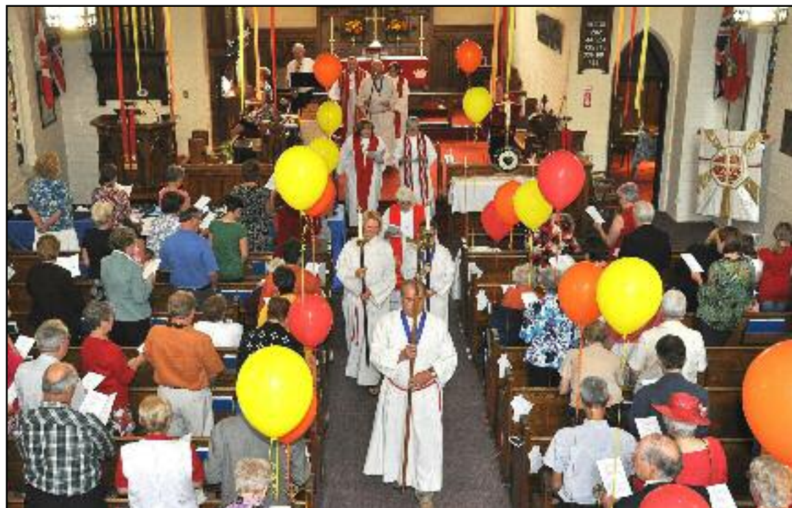
The clergy of St. Mark Anglican Lutheran Church in Midland process out of the church after the service of amalgamation on May 27.