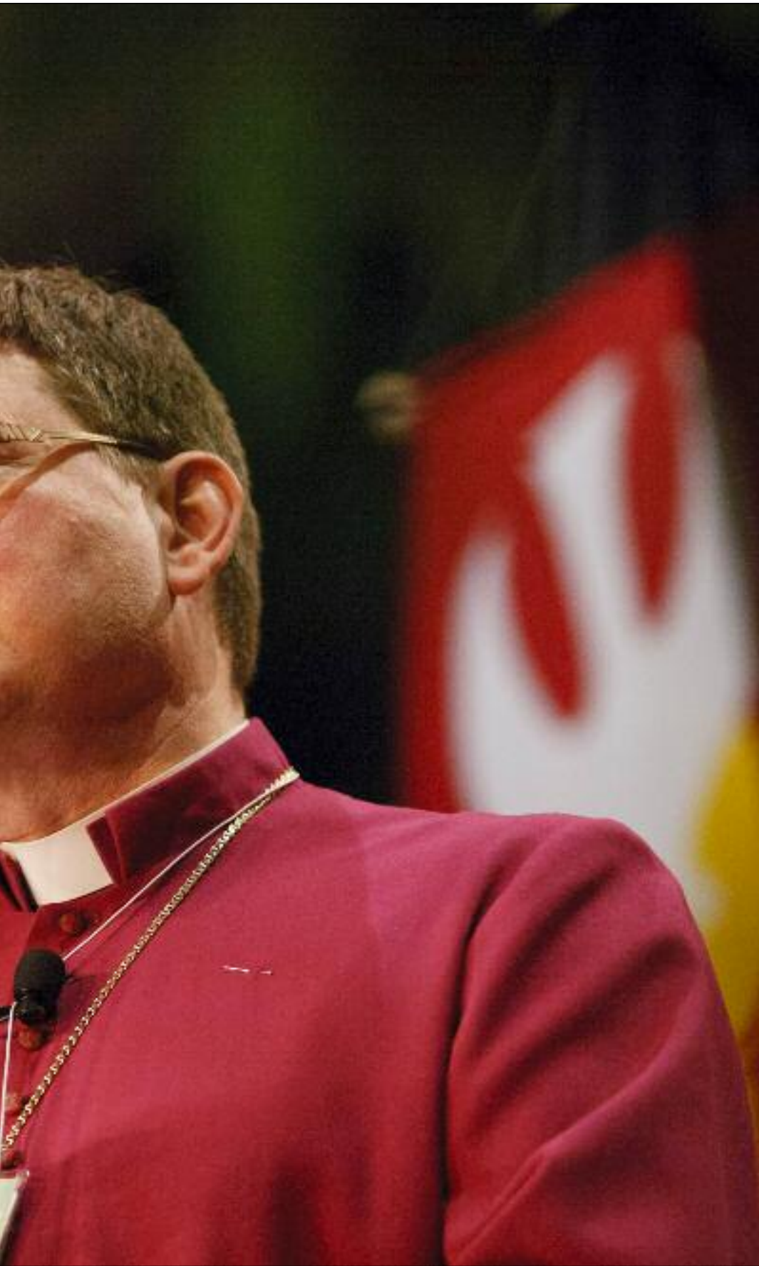
eed to work hard at it, we need to invest in it.'

about place, the land. For Anglicans, the three great feasts are Christmas, Easter and Pentecost, but it seems to me that they are Christmas, Easter and Harvest, at least looking at the numbers.