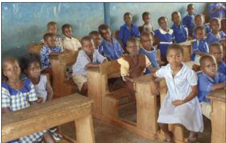
Children at an Anglican school in the Diocese of Wiawso.