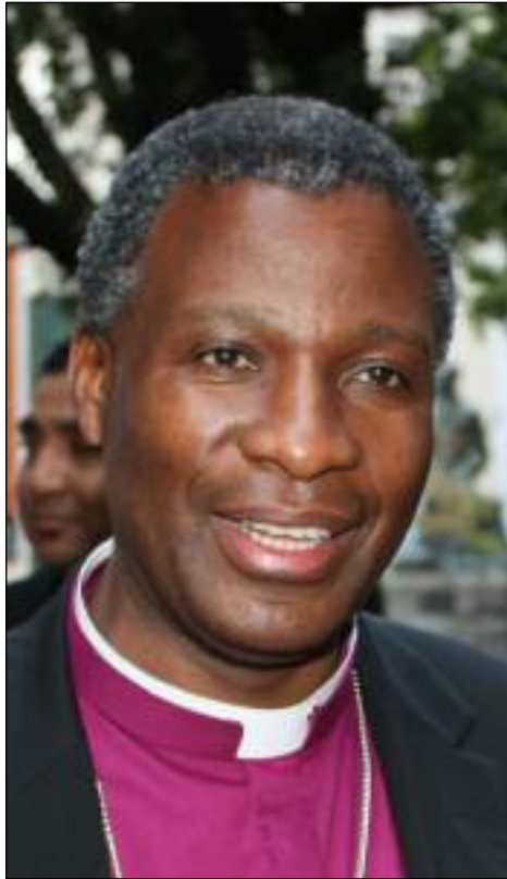
Archbishop Thabo Makgoba

Travelling from Cape Town’s warming weather, with summer about to open upon us, and finding the nights drawing in here and the temperatures dropping, reminds me that Christmas is closer than I had imagined. Soon it will be Advent, and once again we shall be singing “O come, O come, Emmanuel.” Jesus is Emmanuel, God with us. God is not some distant deity—not even an old man in a beard on a cloud somewhere up high—who looks down on us from afar as we struggle with all the frustrations and failings of human existence. No, our God is prepared to step right into the mess and participate in the fullness of what it means to be human.