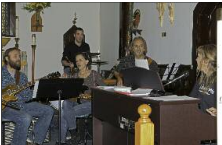
Musicians play at the Rock 'n' Soul service at St. James the Apostle, Sharon.