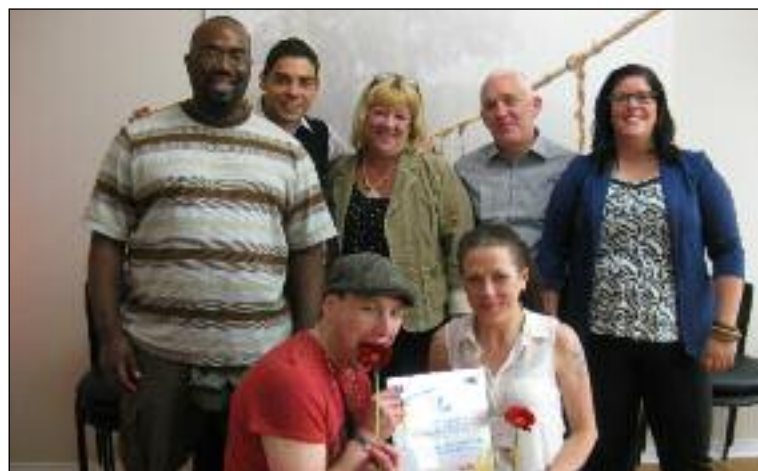
Clients and staff of LOFT's award-winning youth programs.