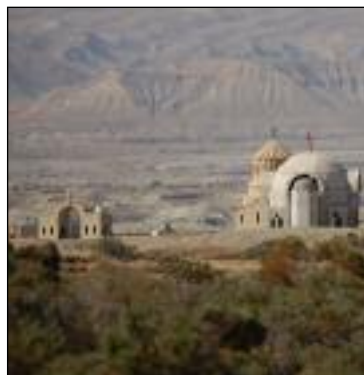
Clockwise from above: workers uncover ceramic images at the baptism site; the Jordan River; churches for pilgrims near the site.