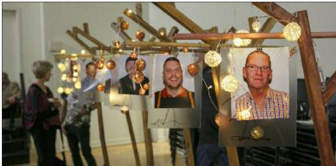
Top: memorial exhibit inside St. Peter, Carlton Street, remembers those who have died of AIDS. At right: women lights candles during the vigil.

The service featured aboriginal sacred dancing, drumming and smudging. Candles were lit by all those who attended. The diocese's