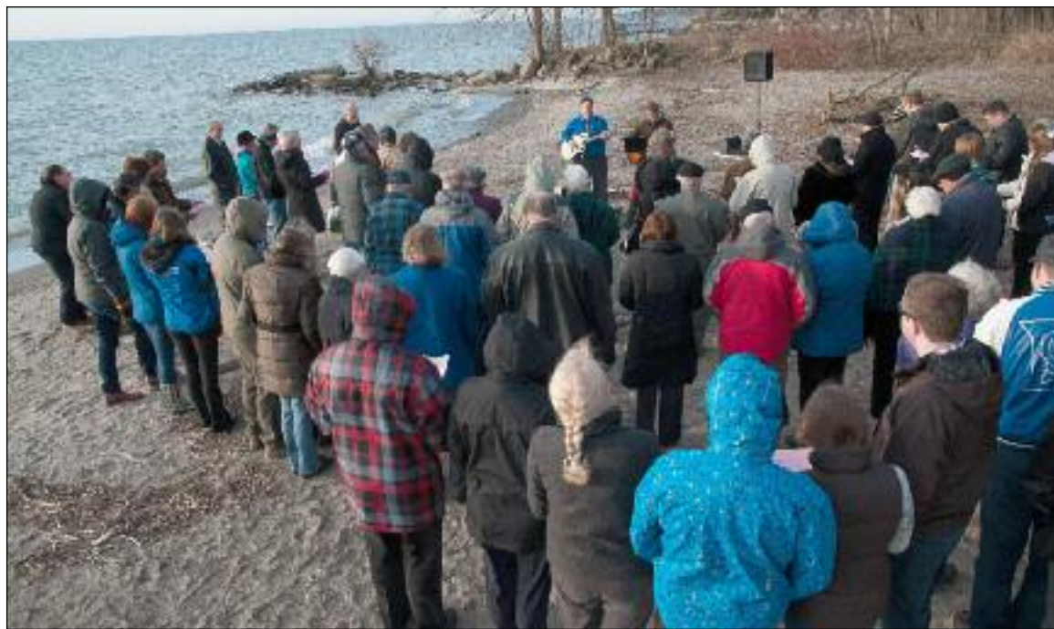
Members of Anglican, Baptist, United and Presbyterian churches in Clarkson worship together at a sunrise service on the shore of Lake Ontario.

In the meantime, the churches are worshipping together on occasion and inviting each other to events. St. Bride's, for example, hosted a More Than Gold event to