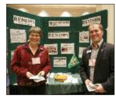
One of many booths at Synod.