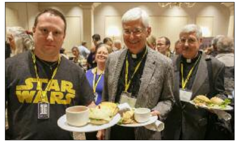
Food is an essential part of Synod.