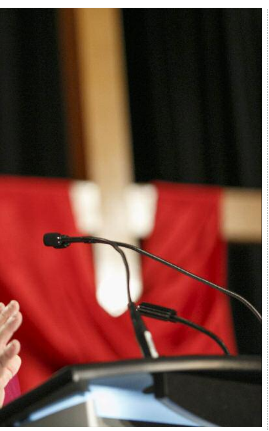
need.'

how we understand who Jesus Christ is. We have difficulty answering the question, "Who do you say that I am?" and even more difficulty telling other people how we answer that. We're reluctant to speak about our faith and hesitant to mention Jesus. Why? Because we don't know Jesus? No, I don't believe that for a moment. We-all of us here-are here because we've had a faith experience. We know something of the risen and glorified Jesus. We know something of the suffering Christ and the compassionate Christ-not just as old stories but as personal stories about Jesus and the Spirit in our lives, about the experience of God's faithfulness in difficult times, of unexpected joys, of transformation and growth, of healing and reconciliation, of hope even in the presence of suffering, of willing self-sacrifice and of the gracious