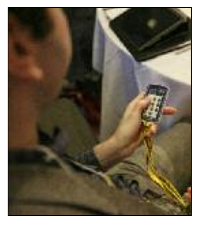
Electronic voting devices keep Synod moving.