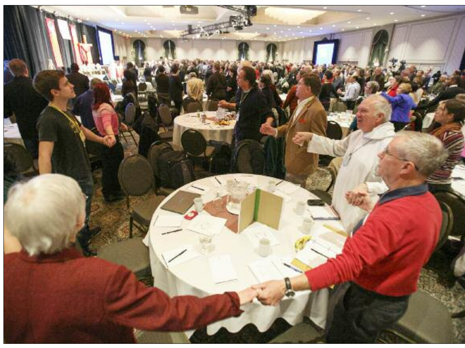
Synod members join hands while singing a hymn.