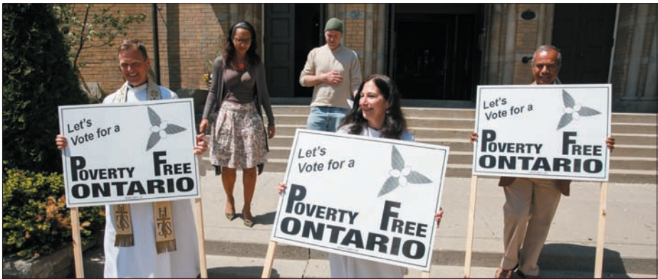
Clergy and parishioners of St. Anne, Toronto, advocate for a better world.

The Social Justice and Advocacy department supports the work of outreach ministries, advocacy groups and those working to advance issues of social justice. The Social Justice and Advocacy Consultant works closely with the Bishop’s Office and with the Provincial Synod Office on advocacy initiatives. In addition, volunteers are active in carrying out work that addresses such urgent and important issues as homelessness, child poverty, and HIV/AIDS. The Social Justice and Advocacy Consultant works with a part-time Parish Outreach Facilitator in the York-Credit Valley episcopal area. Together with volunteers, they support the outreach and advocacy efforts of the diocese and parishes by developing workshops and training, providing resources and working with several volunteer committees to develop capacity around specific key issues. Another significant area of work is the annual Outreach Networking Conference. By supporting outreach ministries throughout the diocese and encouraging Anglicans to respond to inequality in our world, advocacy efforts directly address the diocesan priority to give to others. There is 1 staff position in this area. This budget includes the ministry of All Saints, Sherbourne Street.