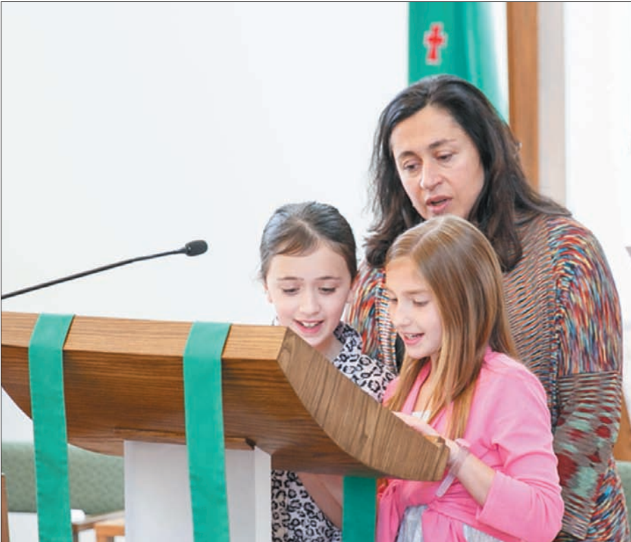
Reading from the lectern at St. George on Yonge, Toronto, during a commissioning service for a new ministry to Mandarin-speaking people.

The Congregational Development team provides support and resources to congregations in the midst of change and growth. In addition, volunteers are recruited and are active in various ways to respond to congregational needs. Staff and volunteers work not only with congregational leaders but also the College of Bishops and other Diocesan Centre staff in addressing parish concerns. There are 4.25 staff positions in this area.