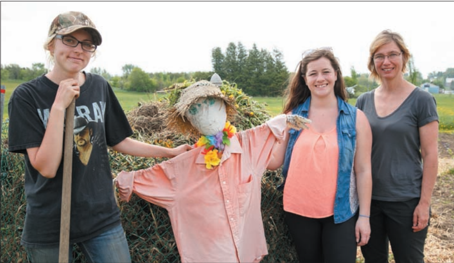
Staff and volunteers from North House Shelter, North Durham, work on a community garden. North House is a FaithWorks partner.

The Stewardship Development team and volunteers are active in various ways to strengthen stewardship at all levels of the church. Key areas of work include the Our Faith-Our Hope campaign, the annual FaithWorks campaign, the Bishop’s Company and the Anglican Diocese of Toronto Foundation. In addition, Growing Healthy Stewards is a unique program designed to engage parishes in a consistent process of education and invitation into a deeper understanding of discipleship. The program operates under the premise that all parishes have the capacity to be healthy and joyful worshipping communities. The results of this program among the participating parishes have been very positive. They include: increased PAG participation, increased giving of pledges, the development of annual narrative budgets, regular preaching on stewardship education, a commitment to increase volunteer recognition, and the promotion of legacy giving. In addition to these activities, the Stewardship Development team shares in initiatives with other dioceses to strengthen stewardship in Anglican churches across Canada. There are 2 staff positions in this area, comprising part of the staff time for the Stewardship Development team.