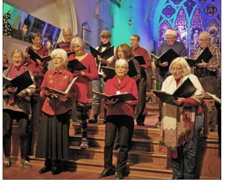
Local merchants and members of St. James choir take part in the first Orillia Christmas Market, held at the church.

the vendors and shoppers. The church is grateful for the generosity of the market's major sponsors, including Orillia Home Hardware,