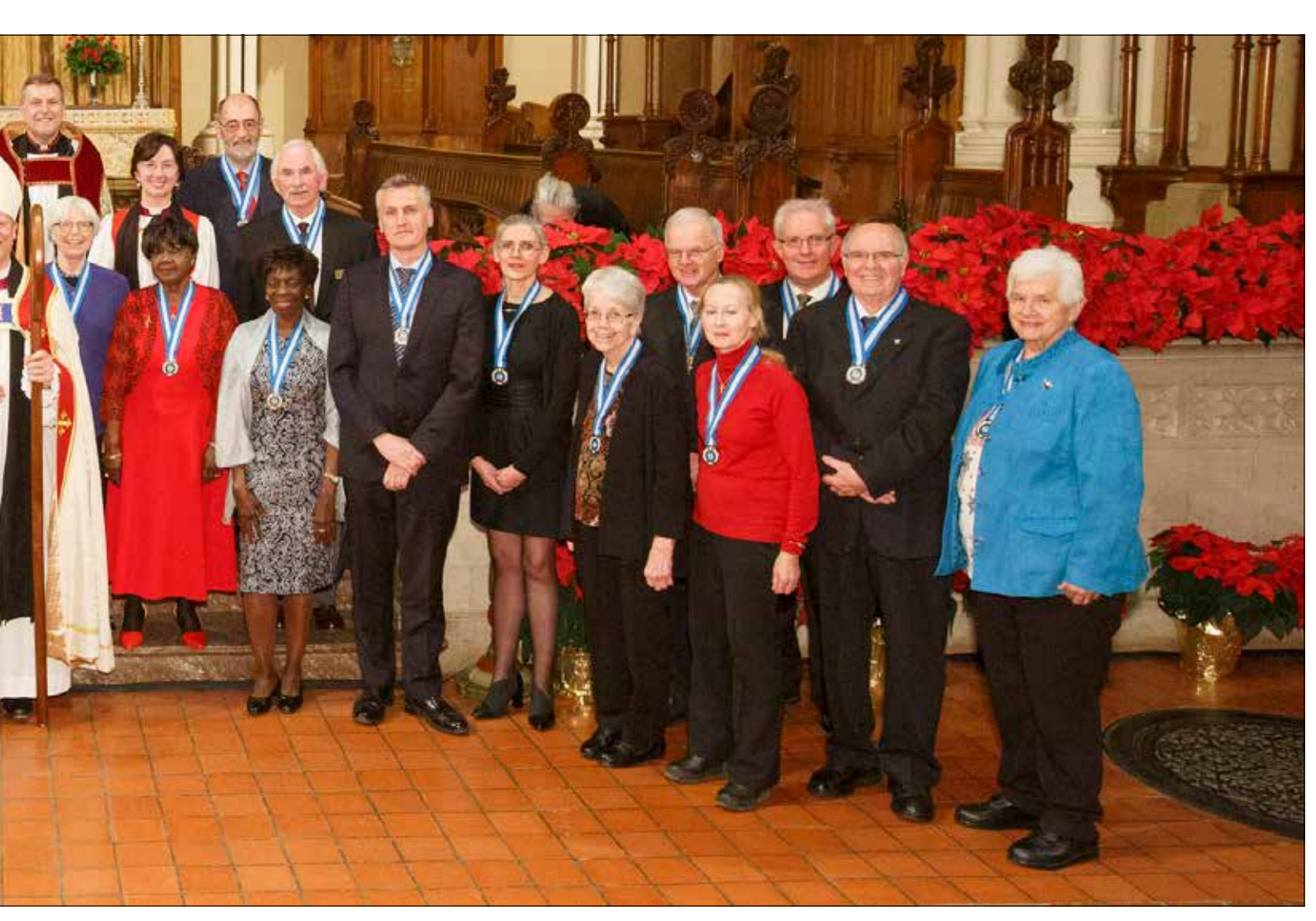
e Page 8.

wardens, and inspired the whole parish to get involved in missional and outreach ministries. Every day, she points us to the example of Mary and Martha in faithfully following and joyfully serving our Lord.