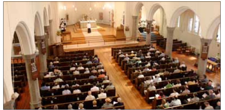
Healey Willan (left), was the choirmaster of St. Mary Magdalene, Toronto (above) for nearly 50 years, making it a North American mecca for choral and Anglican church musicians. A concert on Feb. 16 will commemorate the 50th anniversary of his death.