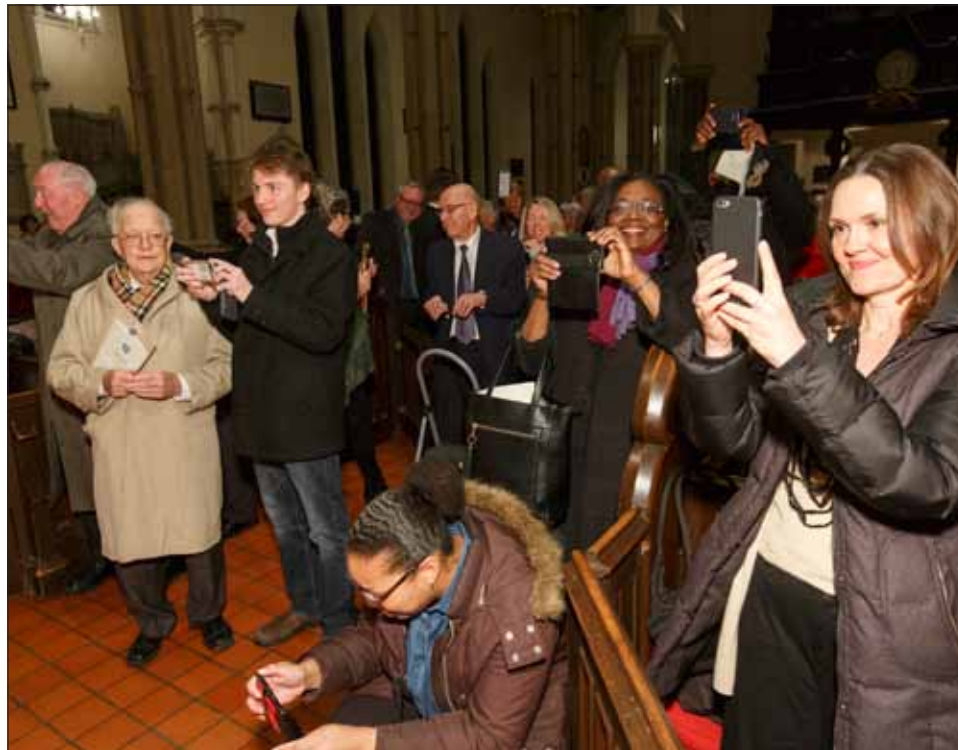
Friends and family members take photos of Order of the Diocese of Toronto recipients after the ceremony on Jan. 1.