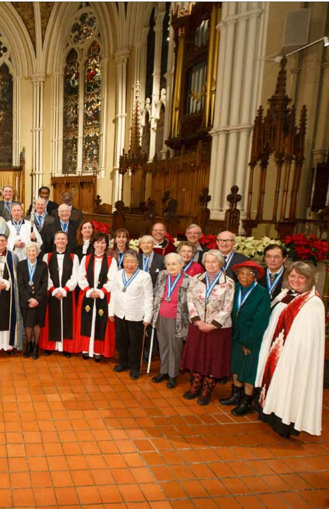
y on Jan. 1 at St. James Cathedral.

military are appreciated and valued by all.