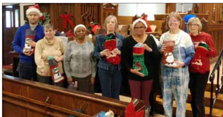
Members of St. Barnabas, Chester pack Christmas stockings for youth at the Kennedy House Youth Centre.

For several years, St. Barnabas, Chester in Toronto has supported the Kennedy House Youth Centre on Pape Avenue with a donation every month. In 2017, the church wanted to be more active in its