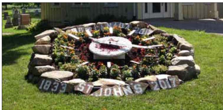
The floral clock outside St. John, Craighurst.

Canada's sesquicentennial celebrations this year provided a great opportunity to mark the occasion