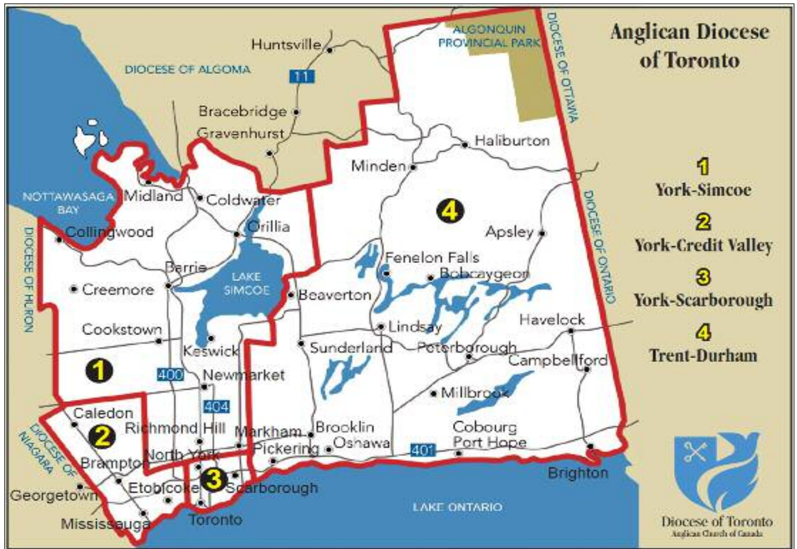
A map of the diocese shows the location of the four episcopal areas – York-Simcoe, York-Credit Valley, York-Scarborough and Trent-Durham.