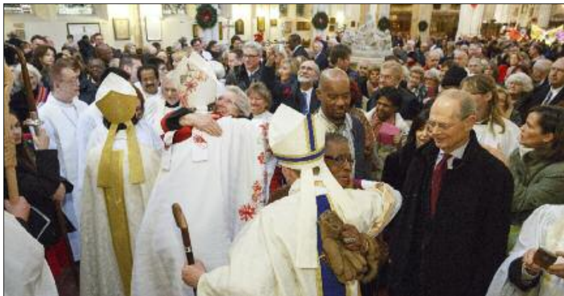
People hug the new bishops after the consecration service.

After the service, many stopped to greet the new bishops and have their photos taken with them. There was much laughter and hugging.