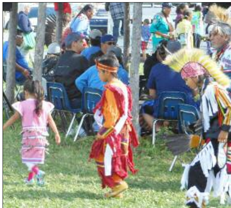
Clockwise from above: A pow-wow at Grassy Narrows; a young girl at the pow-wow; a sign warning of contaminated water at Grassy Narrows.

The group made bannock and learned how to harvest rice in the traditional way. "We attended a