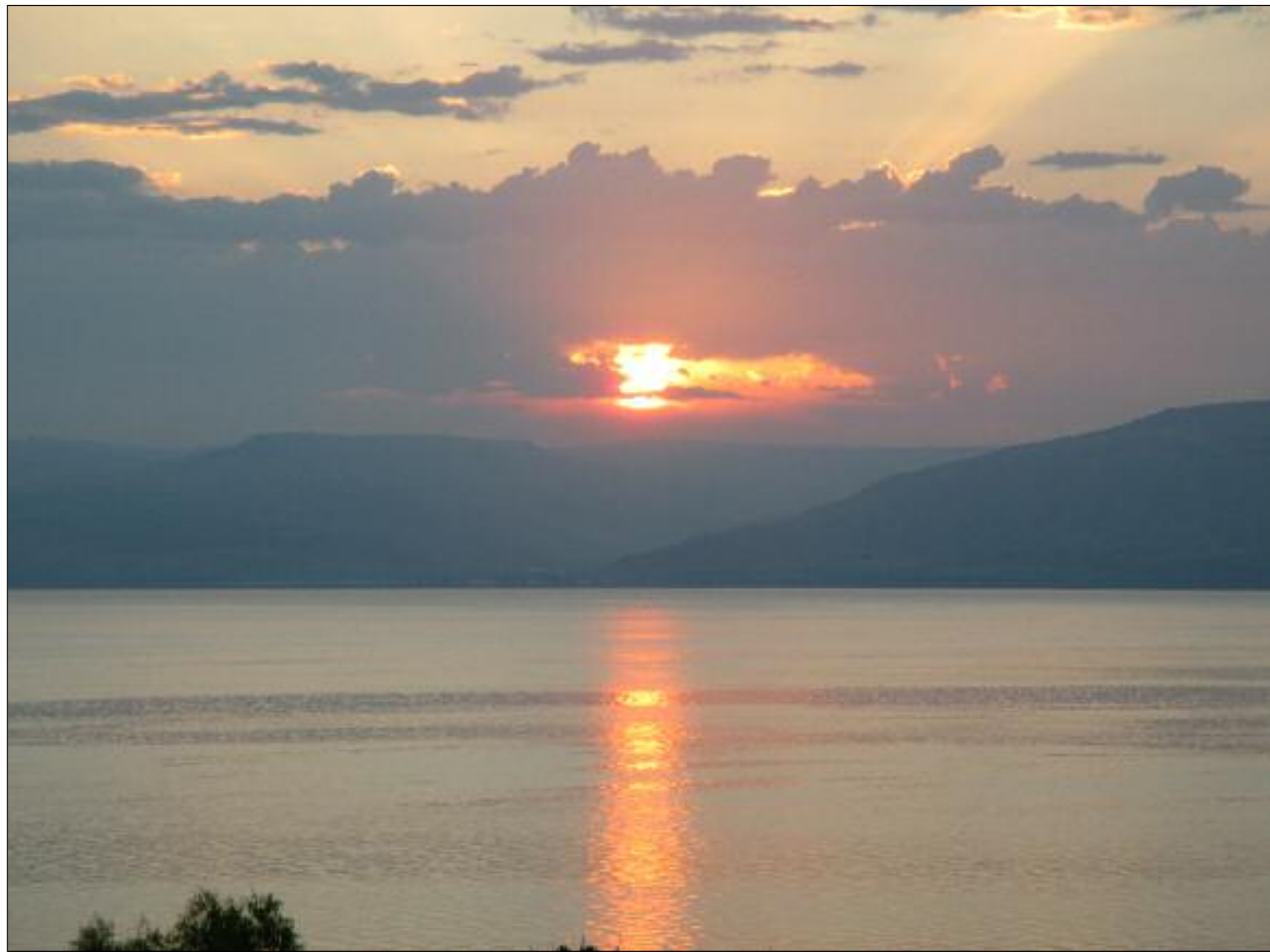
Sunset on the Sea of Galilee. At right, children make food at Nazareth Village, an open-air museum in Nazareth that reenacts village life in Galilee during the time of Jesus.