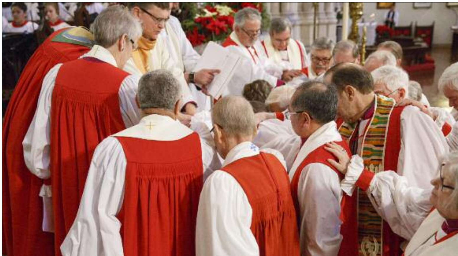
Bishops from across Ontario and from other parts of Canada lay their hands on the head of one of the bishops-elect during the apostolic succession.