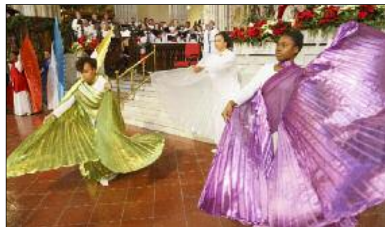
Liturgical dancers perform during the offertory hymn.