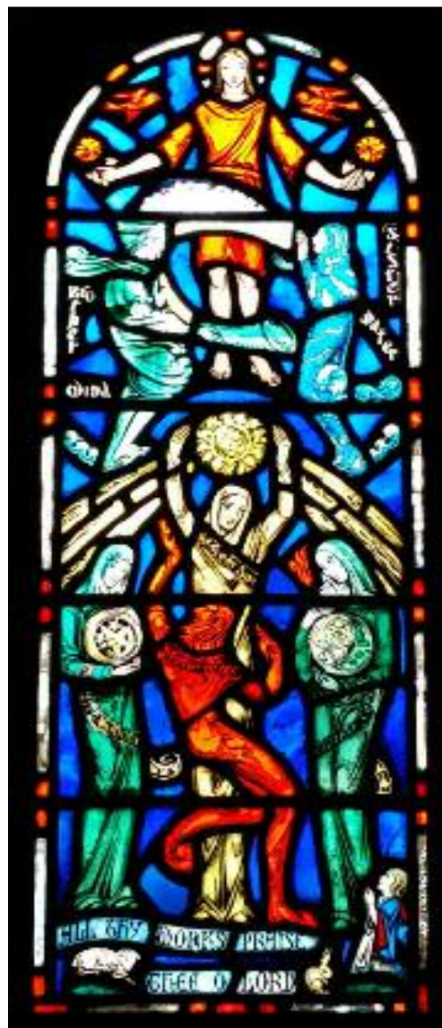
Window depicting St. Francis of Assisi’s Cantic of the Sun at the Community of the Transfiguration’s chapel in Ohio.

As the light streamed through the jewel-toned window that day, it now streams into my mind’s eye. The light of the world is both a memory and a reality. It is said that St. Francis, near the end of his life, was blind when he dictated this cantic: he saw nature through the eyes of his mind. When we cannot see with our physical eyes, our epiphanies still awaken and enliven the eyes of our minds and hearts. The Light of the World shines loving kindness and mercy into our experience-darkened hearts and hurt-closed minds. We are on holy ground together. May this New Year be one of gentle enlightening and grace-filled new life.